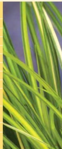
Acorus gramineus 'Ogon'