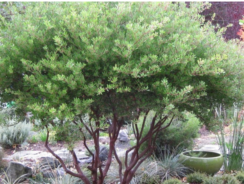
Arctostaphylos x densiflora 'Howard McMinn' in Paul Bonine's garden.