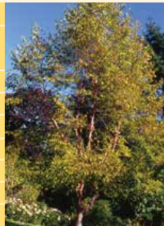
Betula albosinensis var. septentrionalis