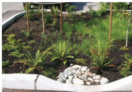
Rain garden at the Evergreen State Fairgrounds.