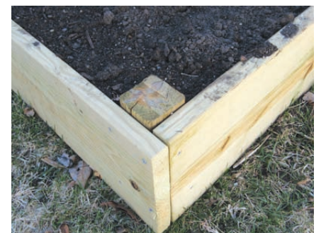
Top off with compost.

You can put raised beds in your backyard, side yard, even your front yard. Sometimes people build many beds and instead of fencing them individually (assuming they have critter problems), they build one big fence around the whole group.