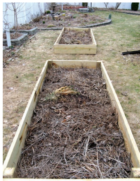
Add fresh organic matter.

I recommend using compost. Fill the boxes to the top with any compost you have or buy bagged compost. You could use regular top soil or garden soil, but compost is only slightly more expensive (pennies) and much more nutritious (natural, slow-release fertilizer). It won't burn, harm or infect your plants, so go for it.