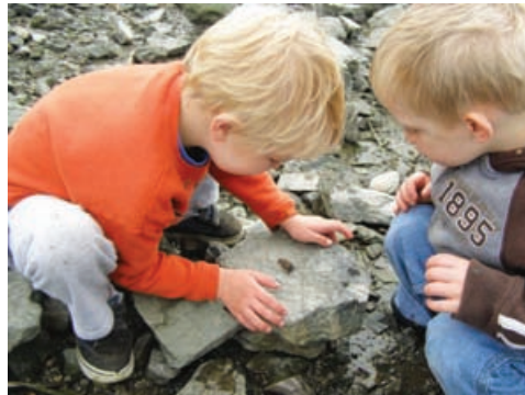
Friends Jack and Joey find a crab sunning on a rock.

If you are concerned about a natural resource issue on your land or are interested in livestock, crop or food production, you have access to