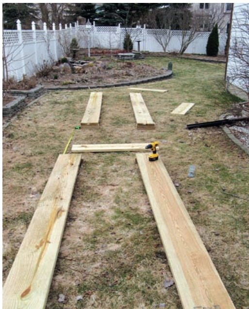
Lay out your boards.