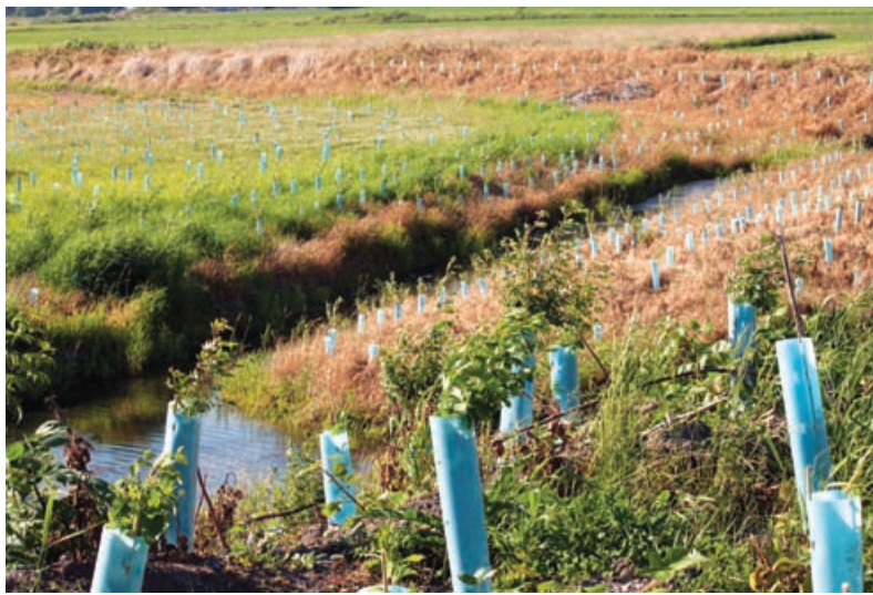
Once fully grown, this stream buffer will provide shade, filter pollutants, feed insects, and shelter wildlife.

Of the three new conservation practices added, hedgerows are the most exciting due to their adaptability and diverse benefits. A hedgerow is a fifteen-foot wide, densely planted thicket of native trees and shrubs that protects streams and wetlands from erosion, pollution and animal damage. A hedgerow along small streams provides excellent protection from pollution and erosion, and creates much-needed habitat for native birds, mammals, amphibians, reptiles and insects. Hedgerows are also appropriate to use along small ditches at the edge of fields. Streams eligible for hedgerow planting can be up to ten miles away from a connected salmon-bearing stream. Hedgerows are eligible for a 75 percent rental incentive bonus.