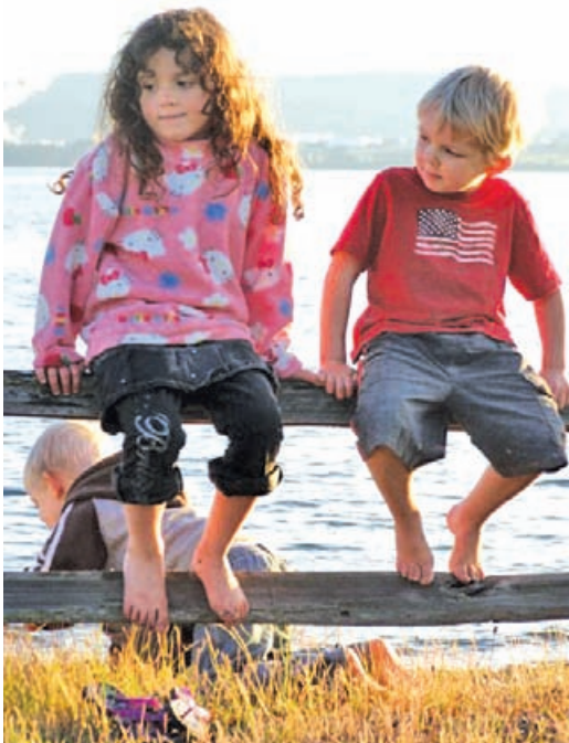
Three friends enjoy quiet time on a local beach.

This concept of future impacts to our children and grandchildren is gaining momentum with the new global 'green revolution'. The Snohomish Conservation District is gearing up to help landowners, farmers, and rural residents make sure that they are not impacting natural resources in a way that would be detrimental to future citizens. The Conservation District is now operating with stable sources of funding in both Snohomish County and on Camano Island. This is in the form of an annual fee called an assessment that landowners pay to help protect resources.