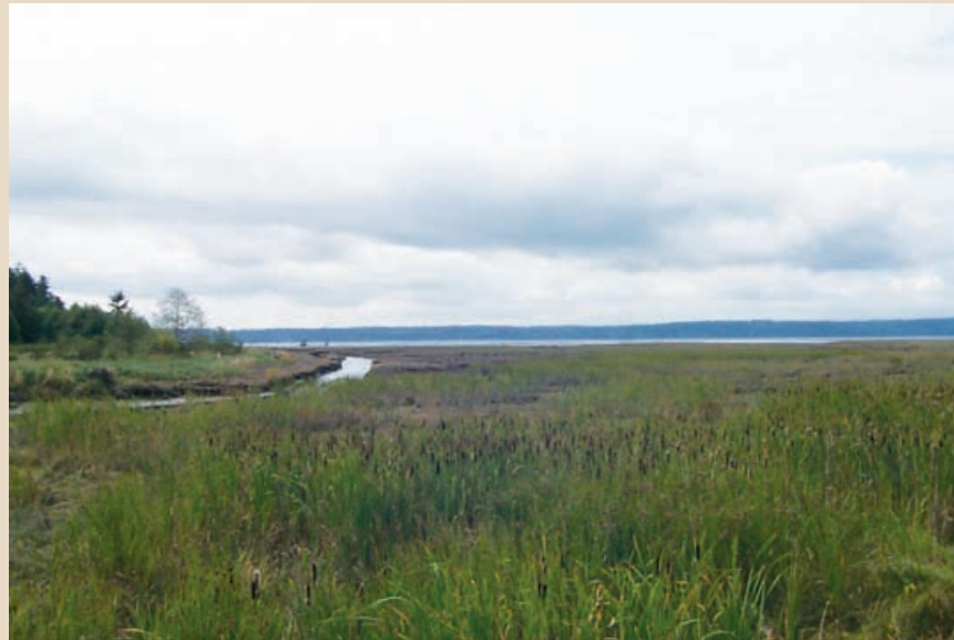
For the first time in 20 years, shellfish can be harvested by the Stillaguamish Tribe in Port Susan Bay.

To help the Clean Water District restore water quality, funding was established for private landowners, community groups, and local agencies to improve water quality via small-scale, on-the-ground projects on private or public property. Snohomish County's Surface Water Management Division manages the fund and is currently accepting applications for projects.